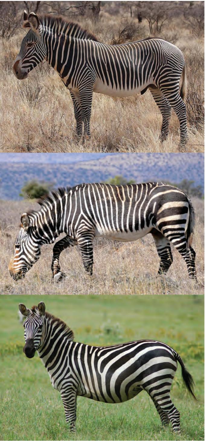
Figure 8. Zebra stripes vary in number and width based on when they begin developing in the embryo (from the top, photos by Rainbirder; Bernard Dupont; Joachim Huber, cc2 Wikimedia).

We now have good biological understanding of how stripes and spots develop, and thus of how slight variations can yield changes. In the 1950s, mathematician Alan Turing described how morphological causal factors diffusing across an area between two source points could interact to create banding patterns. They resemble the interference patterns created in wave tanks in physics classes (Murray, 1988). Turing's scheme certainly works with chemicals in nonliving media (Jones, 2016). Now the patterns have been documented in zebrafish (Nakamasu et al., 2009) and lizards (Edelstein-Keshet, 2017). Indeed, the same mechanism helps create