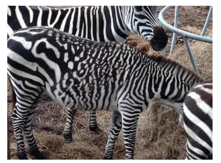
Figure 3. Not all zebras are uniformly striped. Some have spots.

is, the other tigers seem to regard her as a member of the species. Not an error. Just one of the family. Why should we reject their judgment?