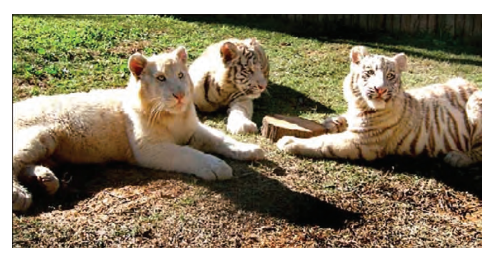
Figure 1. Not all tigers have stripes. Here, a stripeless tiger sits with her two siblings.

So, what should one say about a stripeless tiger (Figures 1 and 2)? These are not just white tigers with stripes (which are also found). Nor are they albinos. These are tigers without stripes. One lounges comfortably with her siblings, who exhibit the more common pattern. That