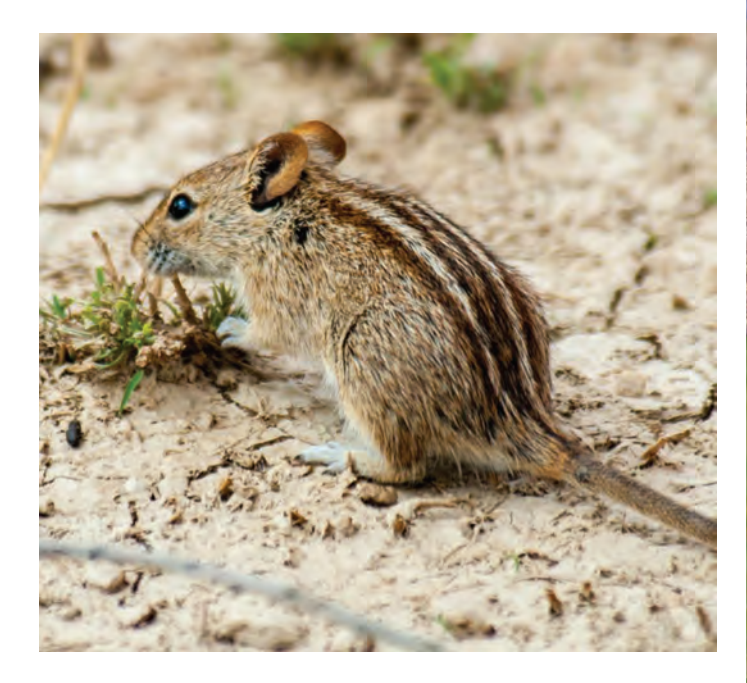
Figure 7. White stripes on the African striped mouse appear where melanocytes have been switched off by the interaction of diffusing morphogens.

embodies change. The "anomalous" examples above were all born to "normal" parents (Figures 1 and 6). Something happened.