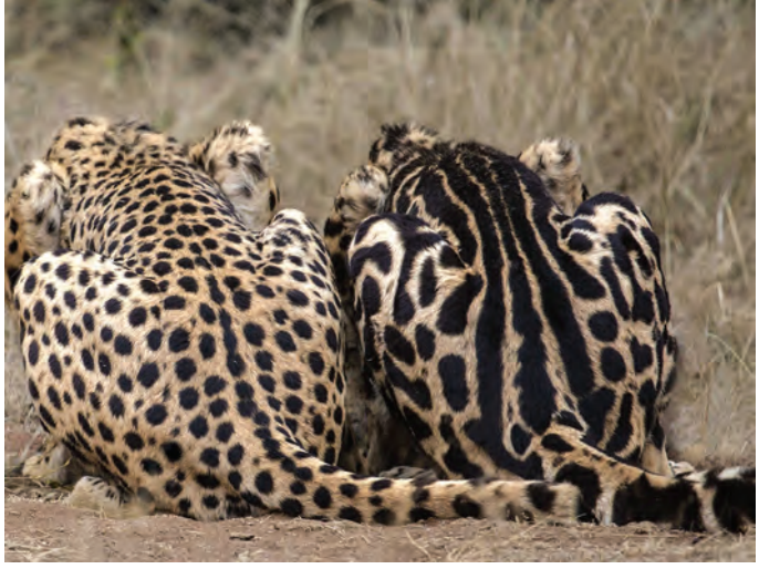
Figure 5. Not all cheetahs are fully spotted. Here, a "king cheetah" with stripes crouches next to one with the more common pattern.