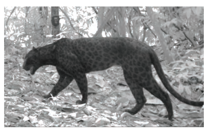
Figure 11. A melanistic leopard (or "black panther") shows its spots in infrared imaging.