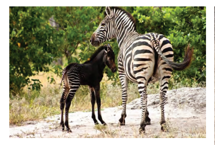
Figure 6. Stripes can sometimes change from one generation to the next. Here, a pseudomelanistic zebra foal stands next to her mother.