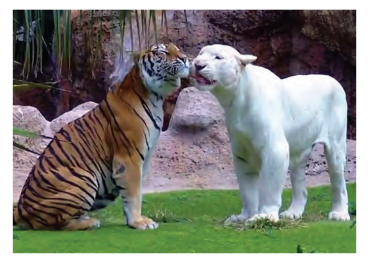
Figure 2. Stripeless tigers are not common, but they are not wholly uncommon.