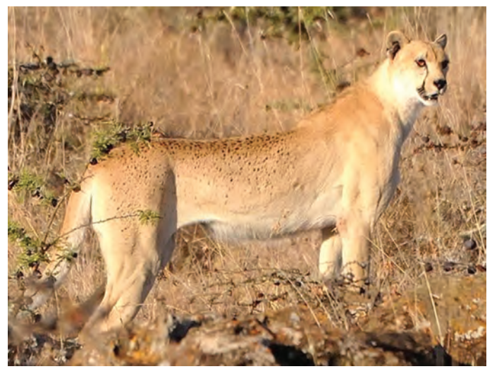
Figure 12. A spotless cheetah, like a black panther, shows pigmentation effects that eclipse underlying patterns (photo by Guy Combes).

white stripes along the midline of the back form by switching off pigment production in the band's melanocytes (Figure 7) (Mallarino et al., 2016; Yong, 2016).