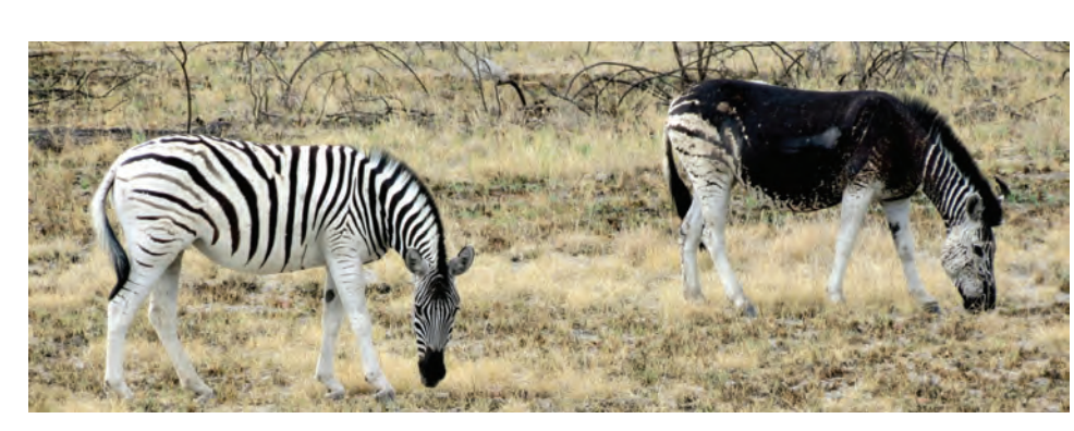
Figure 4. Some zebras have lost their stripes. Here, a pseudomelanistic zebra grazes next to a striped kin.

That still leaves the essentialist notion of fixity, or immutability. But the variation among tigers, zebras, and leopards from one generation to the next also