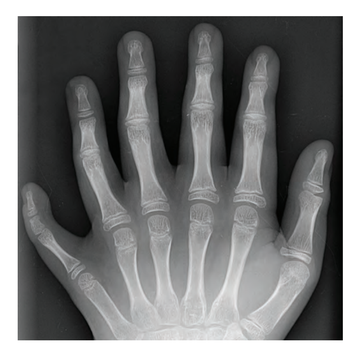
Figure 9. Our hands are striped. Polydactyly reflects a change in the underlying Turing pattern, based on timing in development (Wikimedia).