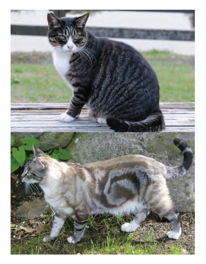
Figure 10. The transition from "mackerel" to "blotched" tabby cat is governed by one transmembrane protein.