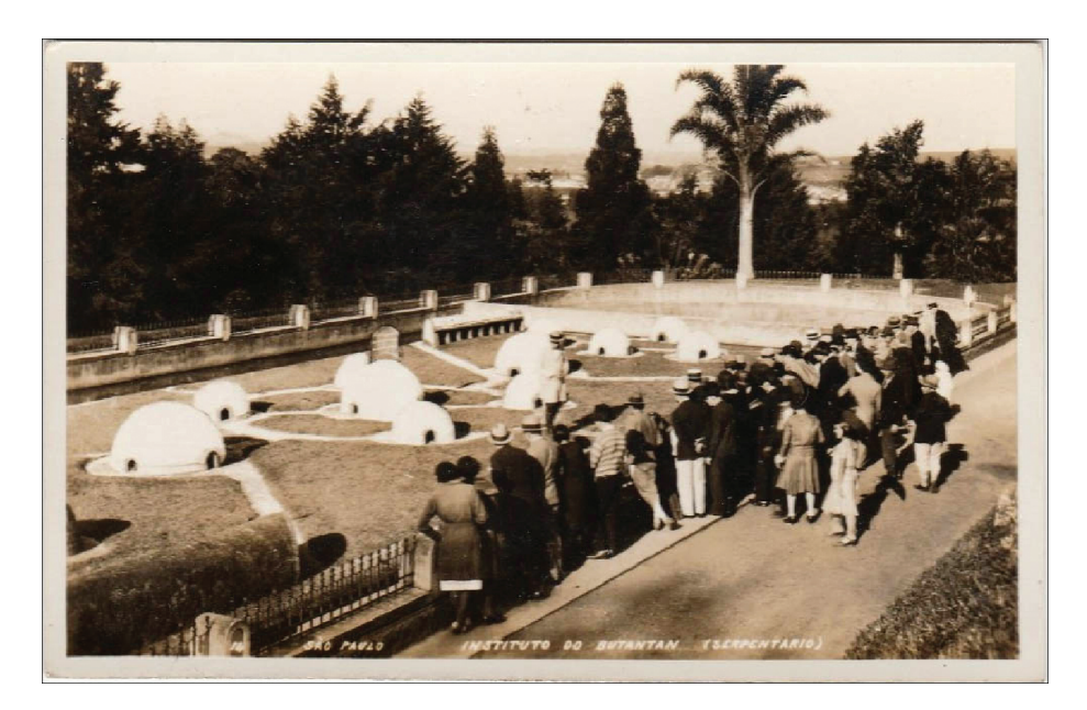
Figure 3. The popular serpentarium at Butantan Institute, São Paulo, Brazil, in the early 1900s.

Brazil had inadvertently discovered the immunological specificity of snake venoms. Calmette's assumption of a common scale of toxicity was exposed and found wrong. That discovery had immense significance for interpreting and treating snakebites.