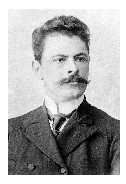
Figure 1. Vital Brazil, 1904.

Not surprisingly, Brazil found none of the local remedies effective. But soon he read about work in France that indicated a role for antisera instead of herbal treatments. Albert Calmette, following other researchers, had immunized animals to snakebites, then extracted their blood serum to treat other organisms that had been bitten. Calmette's approach was to find the most powerful venom and use its