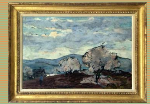
"Spring on the Hudson," by Gifford Beal