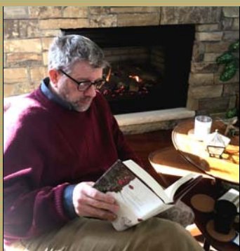
Doing what one does in isolation